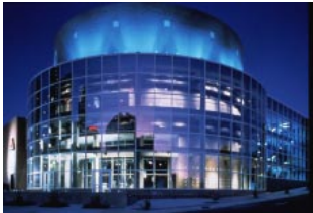
Features of Charlotte's "Discovery Place" Science Center include an IMAX theatre and planetarium.

Overture 17 to the 2003 Assembly alleges that the adoption of the statement last year "has exposed some divisions within the PCA regarding the issue of racism." The overture argues "that the connections of faith and practice, truth and duty have been historically and currently severely compromised"; that "the confusion over that compromise continues even to the degree that the Gospel is in jeopardy, understanding that racism is a clear contradiction to the Gospel in that it stakes our identity as the Church on something other than the truth of Scripture (Gal. 3.26-29; Eph. 2.14-18; Col. 3.11)"; and that "we believe sin has brought division between the races and that God's goal is the healing of these divisions, in anticipation of that great day when there will be a multitude that no one can count, from every nation, tribe, people, and language standing before the throne in front of the Lamb crying out