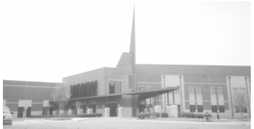
Christ Community Church, Franklin, Tennessee

This blessing has not been granted without challenge, and even the gaining of this ground continues to be challenged. Two presbyteries (South[ern] Florida and Potomac) have scheduled reconsiderations of their approval of the Amendment. Two other presbyteries have explored reconsideration but, so far, have not scheduled it.