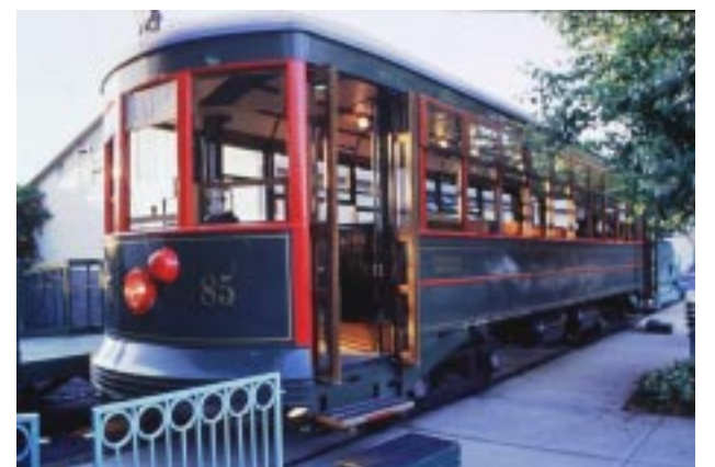
The Charlotte Trolley

Overture 12 from Central Carolina proposes amending the RAO by adding this terminology: "When there are multiple vacancies on a committee, board or commission, no nominee will run directly against another. If a ballot is not used (i.e., voting by voice, standing, show of hands or cards), then the candidates are voted on in the order they were nominated. As soon as one of the nominees receives