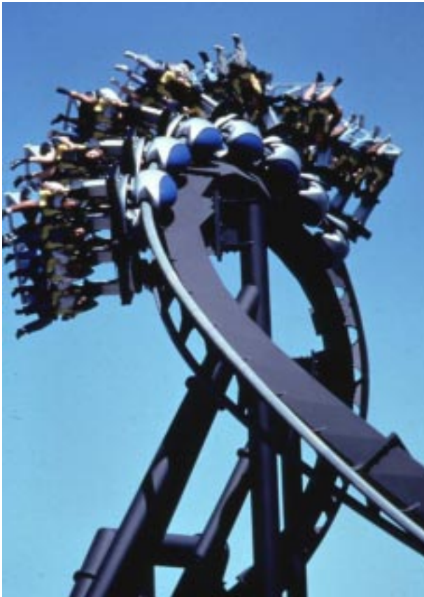
"Top Gun" roller coaster ride at Carowinds amusement park

Five, "The proposed amendment lacks a provision that exceptions be presented in writing and recorded. Even the