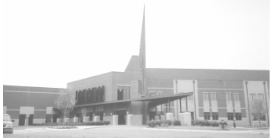
Christ Community Church, Franklin, Tennessee

This blessing has not been granted without challenge, and even the gaining of this ground continues to be challenged. Two presbyteries (South[ern] Florida and Potomac) have scheduled reconsiderations of their approval of the Amendment. Two other presbyteries have explored reconsideration but, so far, have not scheduled it.